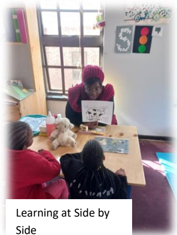
Learning at Side by Side