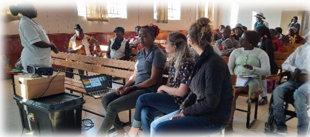
Oshakati CP Workshop