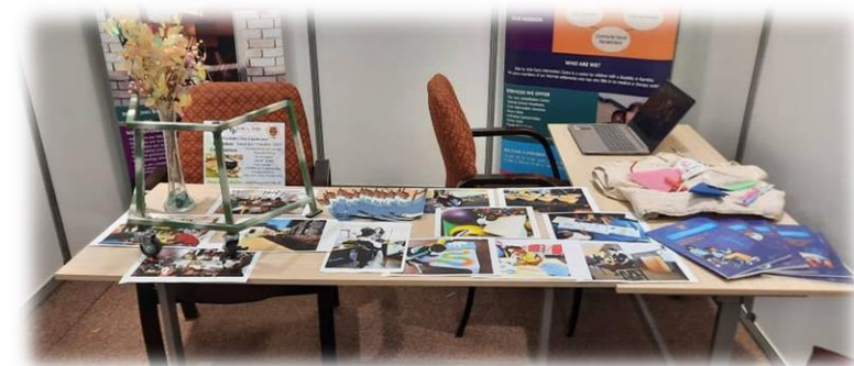
Representation at the Health Expo