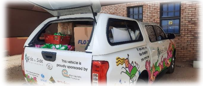
Vehicle loaded with donations for trainings

Our collaborative efforts extend to organizations such as Baby's Cry Foundation, Hands of Hope, Orlandies Children Home, Hope for Life, and numerous others. Through these partnerships, we strive to make a meaningful impact on the lives of mothers, children, and families in need.