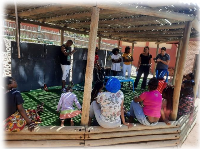
Parents enjoying benefits at Side by Side