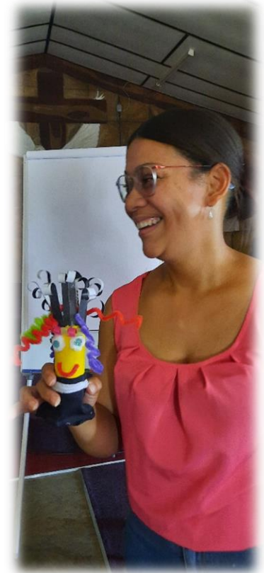
Parent showing off her creation