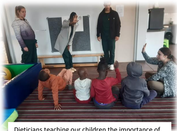
Dieticians teaching our children the importance of good nutrition

Thursdays mark our Clinic Day, encompassing sessions such as the Occupational Therapy Clinic, Dietician Clinic, and occasionally others. In these clinics, therapists or dieticians engage with the children at our school, parents, or the public, providing insights into therapy or promoting healthy nutrition. Additionally, children are identified for nutrition care, feeding programs, or other referrals, which may involve directing them to various facilities, both in the public and private sectors.