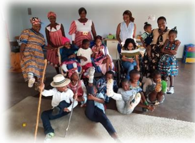
Activities in the Cambri Learn Class

- The class is staffed with 1 teacher, 1 class assistant, and 1 volunteer, all equipped with first aid training. The teacher holds a teaching qualification.