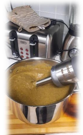
Blender sponsored for the feeding program

Throughout the year, we are occasionally touched by the kindness of individuals who, in their private time, express a desire to contribute or undertake small projects to support Side by Side in areas of need. This year, one of these initiatives had a significant impact on our service provision. We received a heavy-duty blender, along with brand new cutlery and cookware for use in our Side by Side kitchen, benefiting the children in our center on a daily basis. We express our immense gratitude for this thoughtful and impactful contribution. But this was only one of the many kind gestures we received throughout the year and would like to thank every individual who contributed to our centre selflessly.