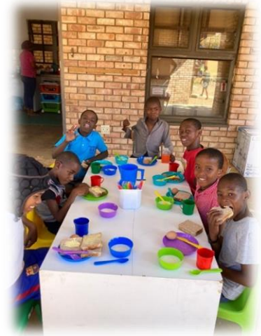
Learning centre enjoying their healthy breakfast

For numerous years, the Lions Club has been steadfast in its commitment to our healthy breakfast program at Side by Side. Their unwavering support goes beyond occasional contributions, as they faithfully provide monthly assistance to ensure that all 45 children in our Learning Centre receive a nutritious breakfast every day. Recognizing that healthy nutrition is paramount to optimal development, the Lions Club's dedication is instrumental in fostering the well-being of the children at our center with severe disabilities. We express our heartfelt gratitude to the Lions Club and other local sponsors for their crucial role in meeting both the nutritional and physical needs of our children.