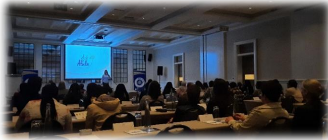
Nurses forum in Swakopmund where Side by Side was a presenting body.

During this engagement, we addressed a gathering of over 70 Occupational Therapists, providing insights into the multidisciplinary approach in the future of Namibian care. Additionally, our awareness campaigns extended to a Nurses Symposium in South Africa, a Nurses Symposium in Swakop, and the OTARG (Occupational Therapy Regional Congress).