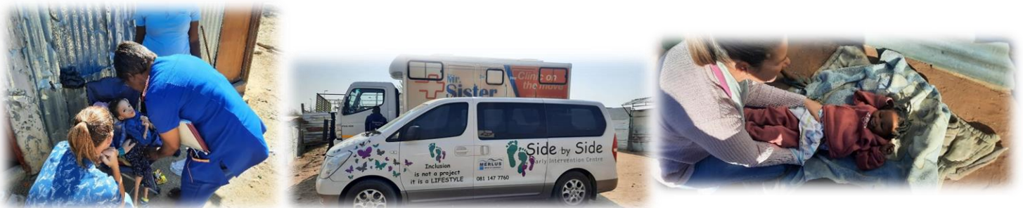
Home Visit assessments