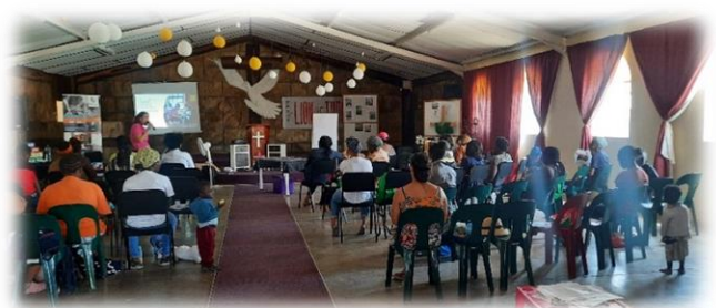
Rosh Pinah Woman's health Workshop