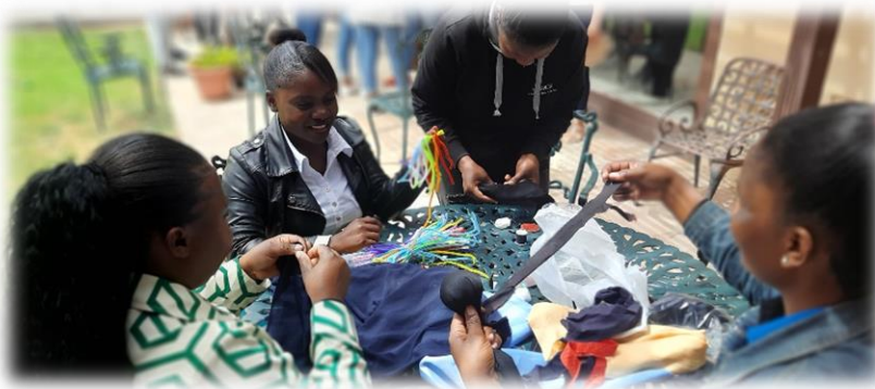
Oranjemund ECD teacher training

These impactful training sessions took place in key locations, including Windhoek, Oshakati, Luderitz, Oranjemund, Rosh Pinah, Gobabis, Okahandja, and more. The diverse topics covered during these sessions encompassed women's health, proper positioning, wound care, healthy nutrition, the use of supportive equipment, medication prescribe to children with disability, health care professionals responsible for their care, the promotion of good citizenship, self-care practices, the ethical use of disability grants, inclusive education and available resources and a range of other relevant subjects.