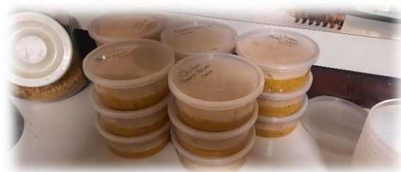
Home made pure for our feeding program